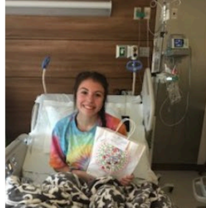
(ABOVE) The Bag of Smiles cheered Gracie up!! Thank you!