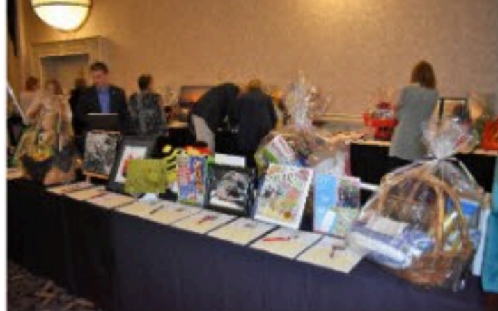
This year's event raised $20,000!