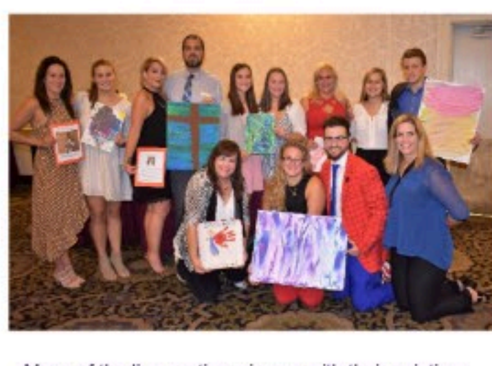
Many of the live auction winners with their paintings