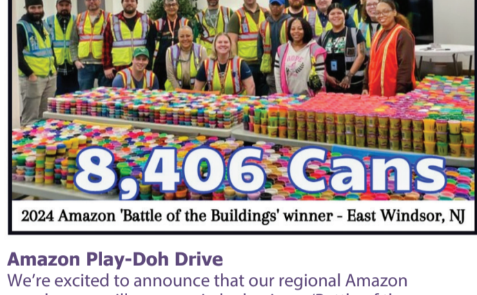
8,406 Cans 2024 Amazon 'Battle of the Buildings' winner - East Windsor, NJ

3303 North Sixth Street Harrisburg, PA 17110